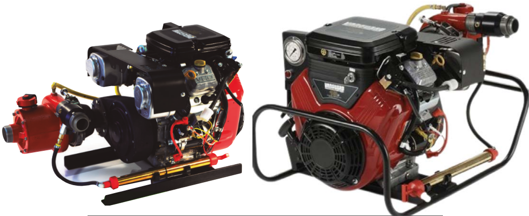
Standard performance correction according to SAE J1349; 15.5°C / 60°F; Baro 101.3 mB / 29.92 inHg.