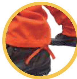
Hem with a system that adjusts to footwear