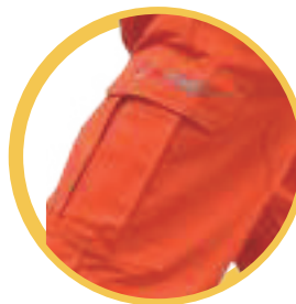
Side pocket with inverted pleat