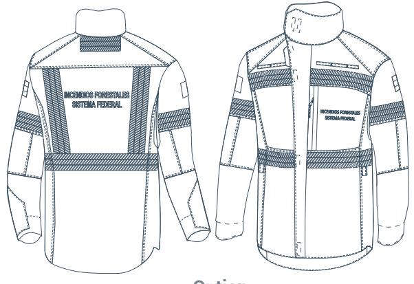
Option raised or closed collar