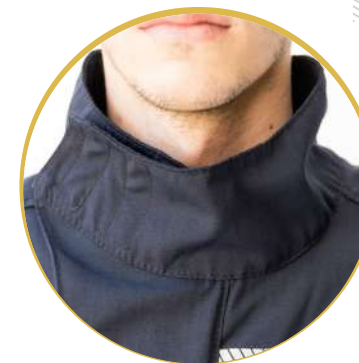
Tipped MAO collar