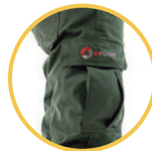
Side pocket with inverted pleat