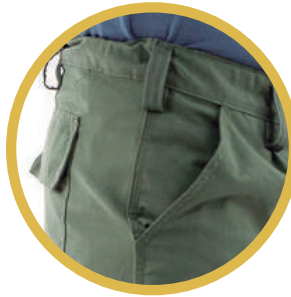
Two side pockets