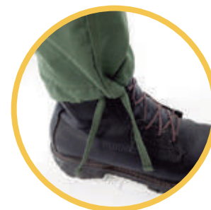
Hem with a system that adjusts to footwear