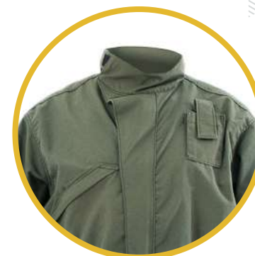
Tipped MAO collar