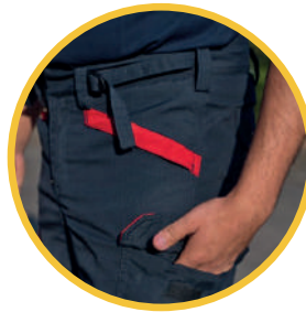
Two lateral pockets