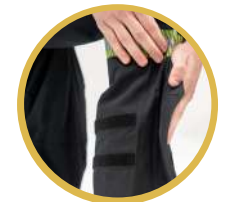
Reflective Tape: Better visibility during day and night.